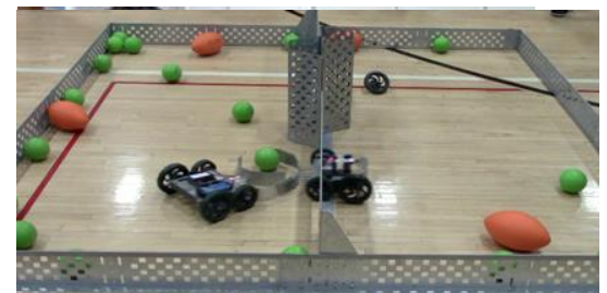
Demonstration of Science Fair project