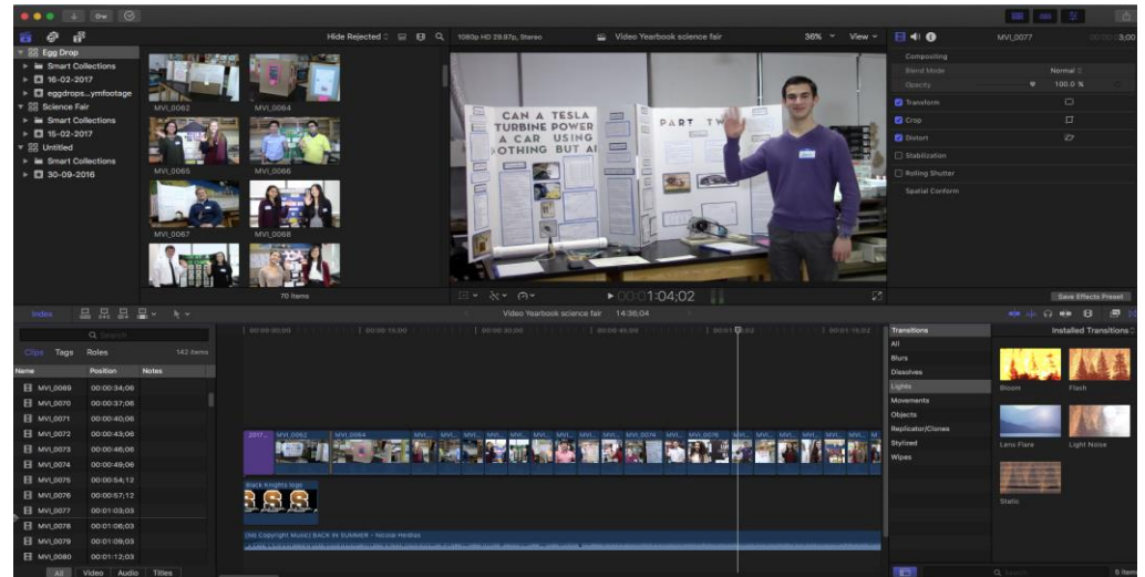
Screen shot of the video production process